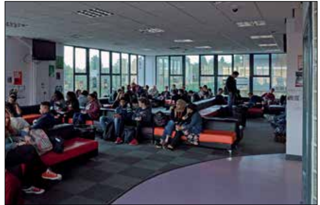
The Sixth Form Common Room