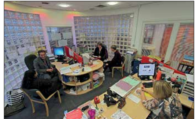
The Sixth Form Office

The provision of dedicated teaching areas, an independent learning area and the Learning Resources Centre (all of which provide ICT access) facilitates the range of learning experiences required at post-16 level. Students also have access to all the other learning resources in the LRC and the school's Careers Library. The social facilities in The Sixth Form Learning Centre promote informal social interaction in a 21st century environment.