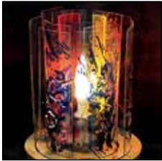
Max Frost Y13