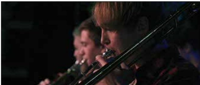
The Christmas Concert

Students' involvement in North Halifax Grammar School's enrichment programme also ensures that our students continue to be active members of the school community, often gaining valuable leadership experience and preparing them for the world outside our gates. While students are expected to participate in at least one extracurricular activity, most of our students will be involved with many more enrichment opportunities.