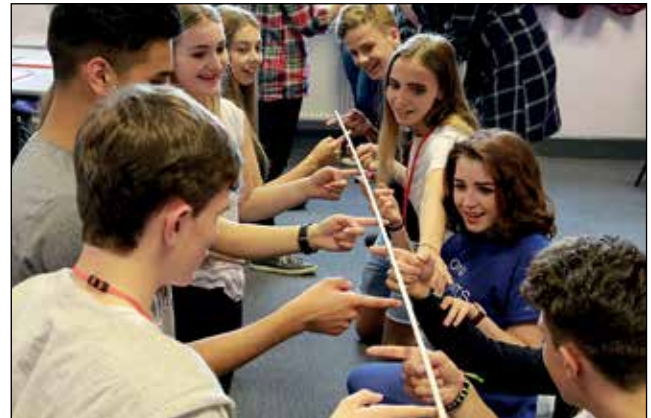
Sixth Form Induction Day