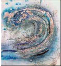
Chloe Bean Y12

"Art doesn't feel like a lesson because of the enjoyment we all get out of it."